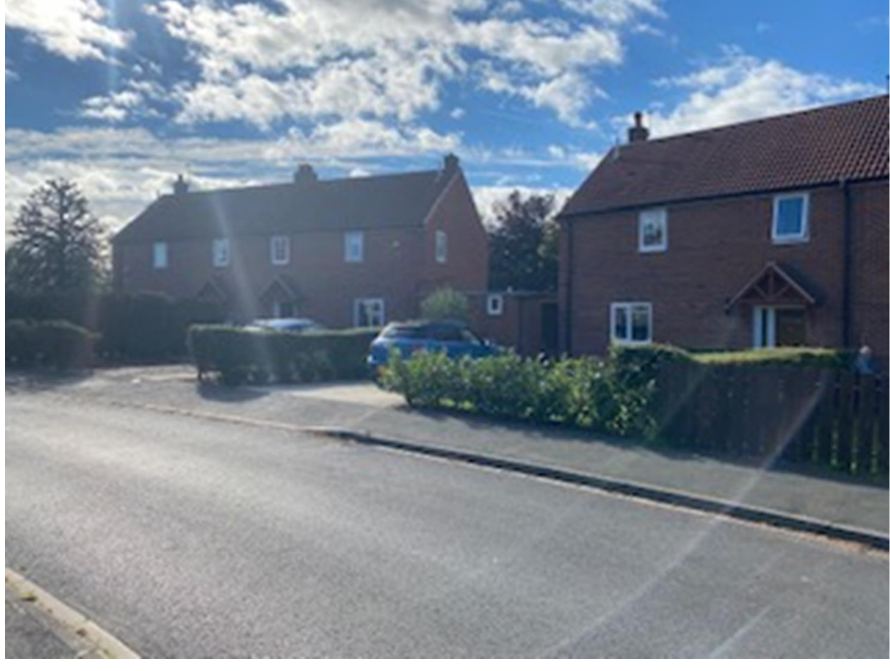
Area Planning Sub Committee Meeting - 8 December 2021

Front and street scene – application property centre